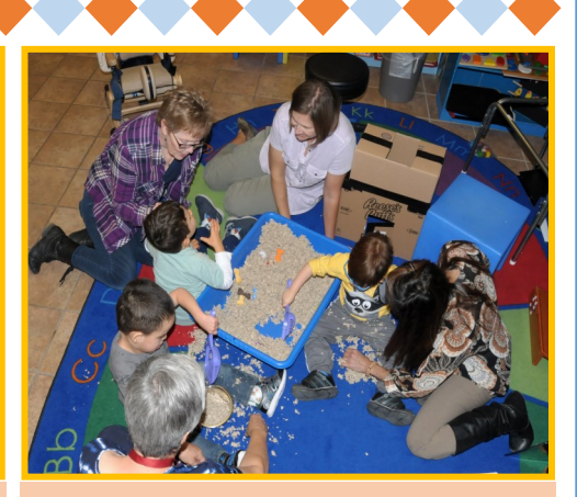
Preschool students exploring different textures and toys in a large bin.